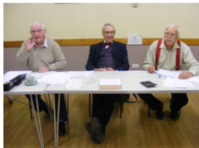
Why are we waiting