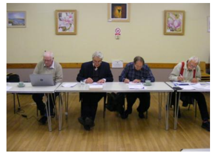
Eyes down – Get bidding