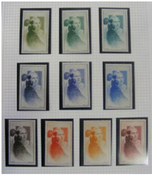
French Lady Forgeries