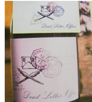
A returned bottle!