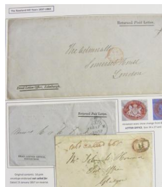
DLO items – Edinburgh Centre