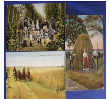
Trees, Veg. and Fields