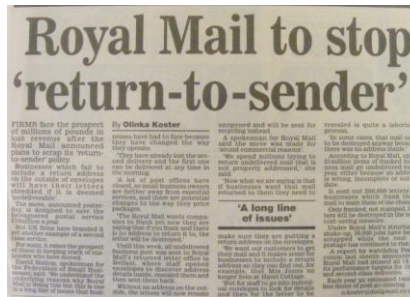
More of Bobs `returns` The Daily Mail headline