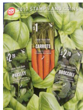
N.Z. Carrot Mail