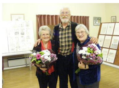
Flowers for our great tea ladies