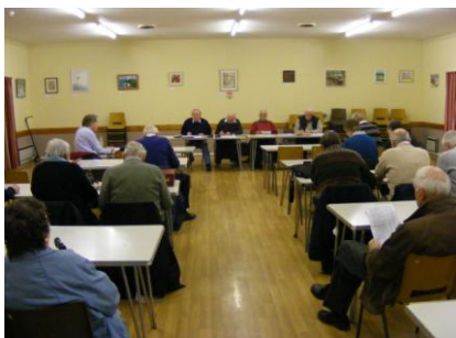
The November Auction