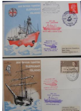
Elephant Island covers