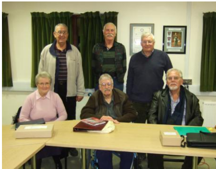
Some of the Thursday 'Postcard' people.