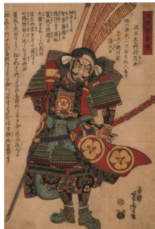
General Sakai Todasugu