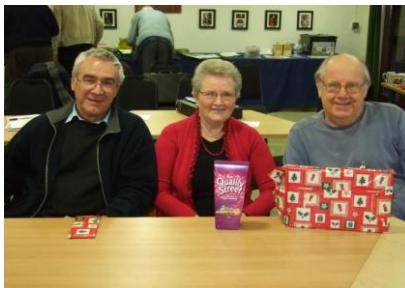
Monday's quiz winners