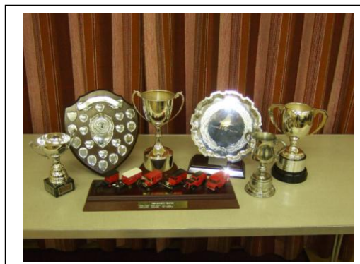
The Society Competition Trophies