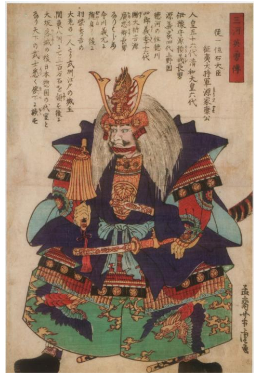
The Shogun Ieyasu Tokugawa

These 3 of 24 cards came from the Ashmolean Museum in Oxford from their Japanese Art exhibition I went to last year.