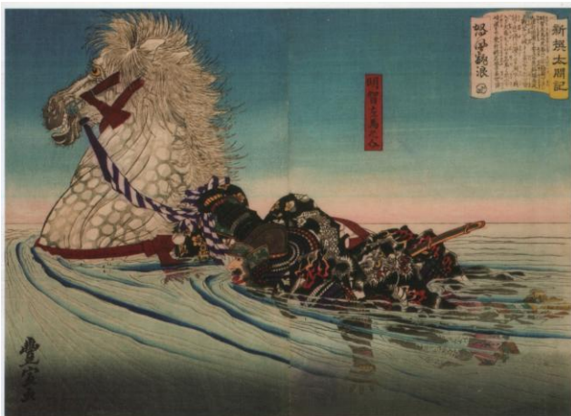
Akechi Mitsuharu crossing a river on his famous horse Okage