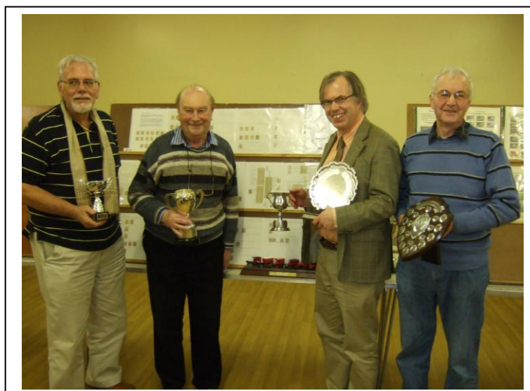
Four of the Christmas Competition Prize-winners

Back page – Club Stamps, Future Events, Society data.