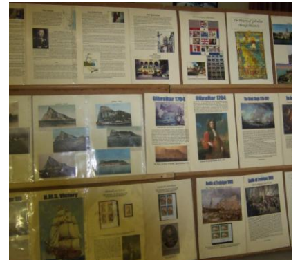
Colin Searle with his superb illustrated power-point display and talk about Gibraltar