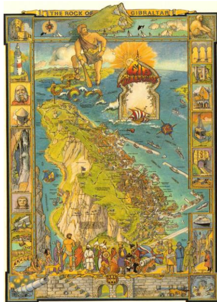
Colin Searle's wonderful postcard of Gibraltar