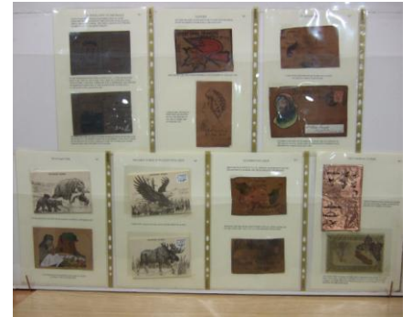
Ian Keel's postcards made from different materials.