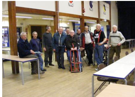
The Friday night 'putter-uppers'