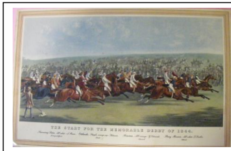
The start of the Derby of 1844