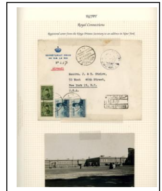
Letter from King Farouk's private secretary to New York