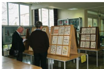
The 9-sheet competition displays