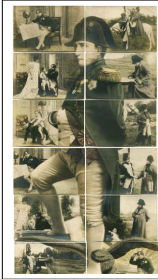
`12-postcard` picture of Napoleon and one of the cards that were sent. (4th down on right)