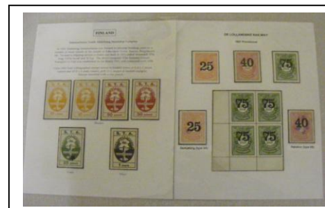
The Finland Steamship Co. and Lollanske Railway issues.