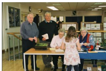
Please can I have a raffle ticket