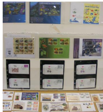
U.N. One Planet One Ocean.