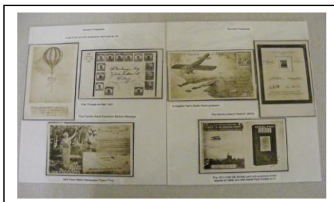
A lovely set of Cinderella Postcards