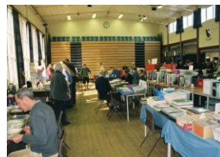
A general view of the fair